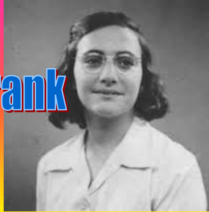
Margot and Anne

MARGOT WAS BORN ON THE 16 TH OF FEBRUARY 1926 AND DIED ON THE 9 TH OF MARCH 1945 SHE WAS AN OLDER SISTER TO ANNE